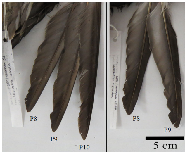
Fig. 4 Scores of the outer primary feathers based on Howell and Patteson (2008). Primary feathers of a Cory's shearwater, Calonectris borealis (left), and Scopoli's shearwater, C. diomedea (CAFURG 626, right), recorded in Brazil. The Cory's primaries (left) represent an individual scored at 1, where P8, P9, and P10 were dark, whereas CAFURG 626 was scored at 4; P10 is not shown in the picture as it had been removed for another study, but P10 of the other wing was checked instead and proved to be totally dark, while P8 and P9 presented a short whitish "tongue"

careful and detailed analysis of body size and colouring of the primaries. Discrimination between Cory's and Scopoli's shearwaters at sea is difficult, as it is necessary to compare body size and/or obtain high-resolution pictures of the birds in flight for comparison purposes, preferentially under the same light conditions and both species together. Occurrences of Cape Verde and Cory's shearwaters in Brazil have been demonstrated mainly with individuals found dead along the coastal regions (e.g., Petry et al. 2000; Lima et al. 2004; Petry et al. 2009). Furthermore, both Cape Verde and Cory's shearwaters are usually observed foraging on the continental shelf at the