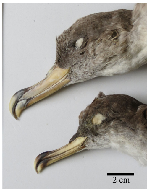
Fig. 3 Cory's (unknown sex, top; CAFURG 652) and Scopoli's (female, bottom; CAFURG 626) shearwaters, highlighting differences in bill length and depth