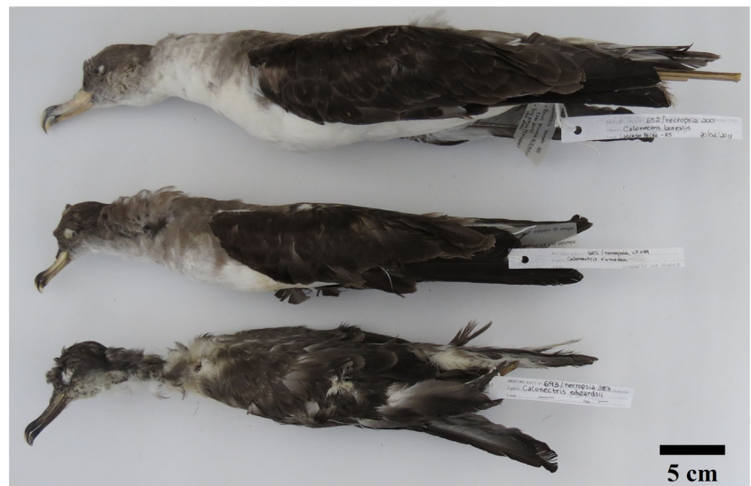
Fig. 2 Shearwaters deposited in the Bird Collection of the Universidade Federal do Rio Grande-FURG (CAFURG) (Bugoni et al. 2008a). From top to bottom: Cory's shearwater, Calonectris borealis (CAFURG 652); Scopoli's shearwater, C. diomedea (CAFURG 626); and Cape Verde shearwater, C. edwardsii (CAFURG 693)

State University, USA. Stable isotopes from the three forms sampled on the colonies had been previously measured and used for population and species assignment (Gómez-Díaz and González-Solís 2007), allowing effective comparison.